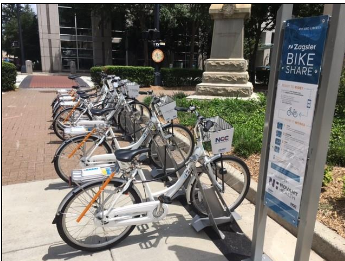
Figure 1: Bike Share Station at the intersection of 4 th Street and Liberty Street.