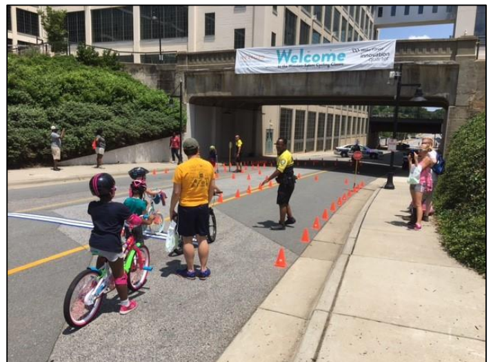
Figure 2: Walk & Roll Winston-Salem 2017.